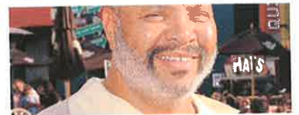
James Avery, best known as Will Smith's Uncle Phil in 'The Fresh Prince of Bel-Air', has died.